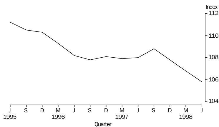
Price index of WAPHI

The Western Australian Produced Hardwoods Index (WAPHI) decreased by 0.9% for the June quarter 1998, the same decrease as in the previous two quarters. For the year ending June quarter 1998, the index decreased 2.0%. Price decreases in the current quarter reflected changes which occurred in the local and export markets for hardwoods.